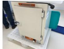
Reference: LFR-071 LABORATORY OVEN Year: . Brand: P SELECTA