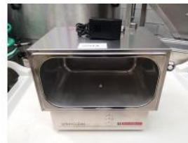
Reference: LFR-041 SMALL TOOLS SANITIZER Year: . Brand: NICOMAC