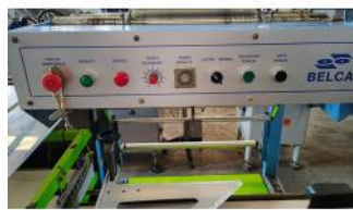
Reference: ICS-002 HORIZONTAL BAGGING MACHINE Year: . Brand: BELCA