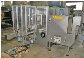
Reference: PUG-002 SHRINK WRAPPING MACHINE Year: 2003 Brand: IMA