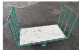
Reference: MRT-083 TRANSPORT TROLLEY Year: . Brand: OMAV