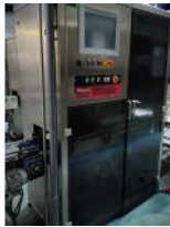
Reference: NTM-064 LABELS DISPENSER Year: 2017 Brand: MACSA ID