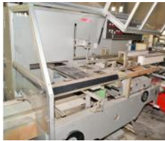
Reference: PUI-002 CARTONING Year: 1999 Brand: CAM 7 SRL