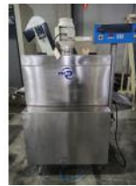
Reference: SSM-015 RETRACTABLE TANK Year: 2010 Brand: ZERMAT