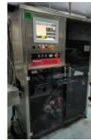
Reference: NTM-060 LABELS DISPENSER Year: 2017 Brand: MACSA ID