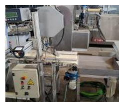
Reference: ICS-004 LABELING HEAD Year: 2012 Brand: ETIMA