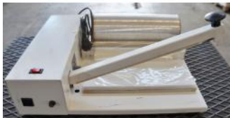
Reference: ICD-018 SEALING MACHINE Year: . Brand: SRINCK-A-PACK