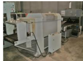
Reference: LVS-002 PACKING MACHINE Year: . Brand: CIPRO