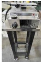
Reference: ITD-015 INK MARKER FOR BOXES Year: . Brand: .