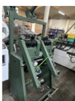
Reference: ZIP-028 WINDER Year: . Brand: MOTOCONO