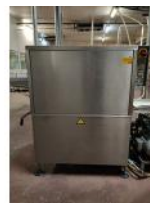
Reference: MOR-079 IMMERSION RETRACTABLE TANK Year: 2005 Brand: INELVI