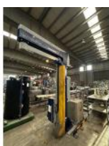
Reference: IDL-001 PALLET WRAPPING MACHINE Year: 2019 Brand: ROBOPACK