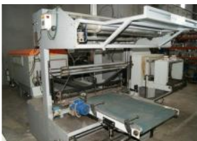
Reference: LVS-001 PACKING MACHINE Year: . Brand: IM2