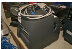
Reference: SON-002 LABEL PRINTER Year: . Brand: CITIZEN