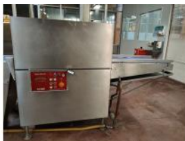
Reference: MOR-077 IMMERSION RETRACTABLE TANK Year: . Brand: INAUEN