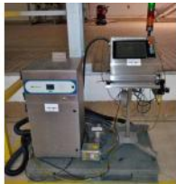
Reference: NUT-012 LASER MARKER Year: 2005 Brand: DOMINO