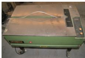
Reference: ANT-017 STRAPPING SEMI-AUTOMATIC Year: . Brand: STRAPEX