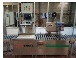
Reference: MOR-084 WEIGHING AND LABELING TRAIN Year: 2004 Brand: TAVIL