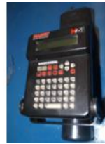
Reference: BU-066 CODING SYSTEM Year: . Brand: MARSH