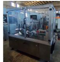
Reference: FLT-001 LINEAR DOUBLE HEAD LABELLER Year: 2005 Brand: ETIMA