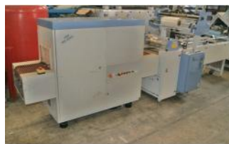
Reference: SON-006 PACKING MACHINE Year: 1997 Brand: CB EMBALLAGE