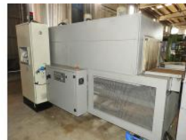
Reference: AFG-016 SHRINK WRAPPING OVEN Year: 2007 Brand: DIDEM