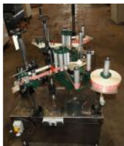
Reference: AFG-005 DOUBLE HEAD LABELLER Year: 2007 Brand: REVERSIBLE LABELLERS COMPANY