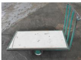
Reference: MRT-082 TRANSPORT TROLLEY Year: . Brand: .