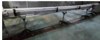
Reference: NTM-049 CONVEYOR BELT Year: 2015 Brand: INOX-FERRO SANCHEZ S.L