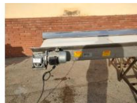
Reference: PNS-040 PLASTIC BAND CONVEYOR BELT Year: 2003 Brand: MARTIN MAQ