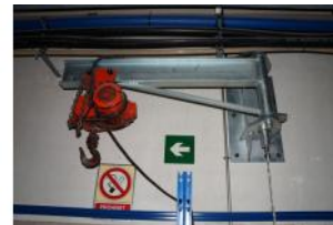
Reference: TOR-005 HOIST FLAG Year: . Brand: .