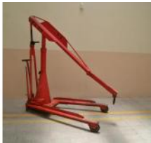
Reference: STI-253 WORKSHOP CRANE Year: . Brand: .