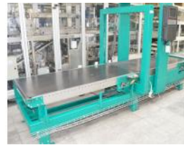
Reference: TCZ-009 PLASTIC BELT CONVEYOR Year: 2003 Brand: VAN DAR LANDEN