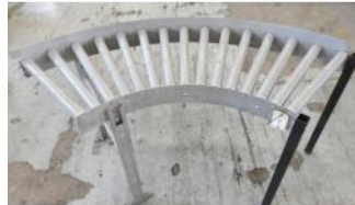
Reference: VIL-031 UNMOTORIZED ROLLER PATH Year: . Brand: .