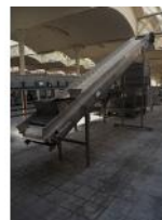
Reference: PNS-073 PRODUCT ELEVATOR Year: 2003 Brand: MARTIN MAQ