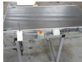
Reference: SER-170 CONVEYOR BELT Year: . Brand: .