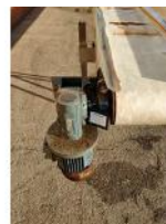
Reference: PNS-030 PLASTIC BAND CONVEYOR BELT Year: . Brand: .