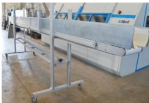
Reference: ADT-007 PLASTIC BAND CONVEYOR Year: . Brand: SINERGES