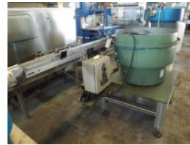
Reference: CYP-035 VIBRATING PRODUCT FEEDER Year: . Brand: .