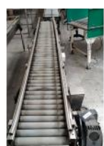
Reference: FTR-034 MOTORIZED ROLLER CONVEYOR Year: . Brand: .