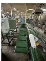
Reference: ZIP-012 CONVEYOR BELT Year: . Brand: .