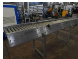
Reference: AFG-011 MOTORIZED ROLLER CONVEYOR Year: . Brand: .