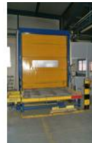
Reference: STI-067 TRANSPORT LINE FOR PALLETS Year: . Brand: ESPAÑOL