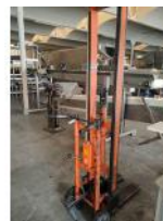
Reference: EYL-031 HYDRAULIC ELEVATOR Year: . Brand: .