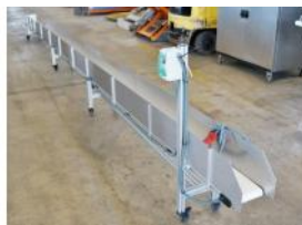
Reference: ADT-004 CONVEYOR BELT Year: . Brand: SINERGES