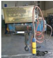
Reference: AMA-057 HOIST Year: 1990 Brand: TALLERES ESQUIVEL