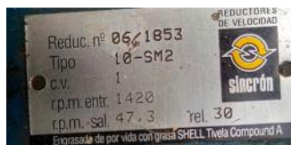
Reference: FTR-030 CONVEYOR BELT Year: . Brand: TAHFER