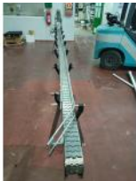
Reference: TVE-045 STAINLESS STEEL CONVEYOR BELT Year: . Brand: .