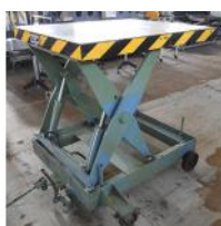
Reference: FGM-007 LIFTER PANTOGRAPH Year: . Brand: VINCA