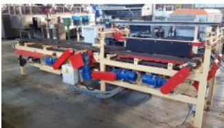
Reference: CAO-048 TURNING CONVEYOR BELT FOR CERA... Year: 2006 Brand: EQUIP CERAMIC