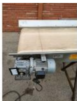
Reference: PNS-031 PLASTIC BAND CONVEYOR BELT Year: 2003 Brand: MARTIN MAQ