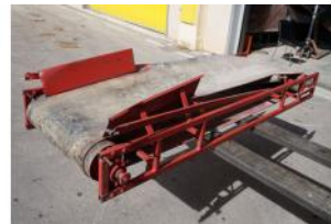
Reference: DYN-008 SMOOTH RUBBER BAND Year: . Brand: .