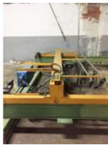
Reference: MTB-066 BRIDGE CRANE 2.5Ton Year: 2003 Brand: VERLINDE