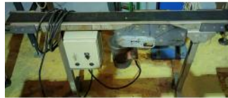
Reference: FLT-003 CONVEYOR BELT Year: . Brand: RODANT