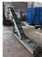
Reference: ICS-014 PRODUCT ELEVATOR CONVEYOR Year: 1998 Brand: CRIZAF