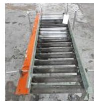
Reference: NCC-185 MOTORIZED ROLLER CONVEYOR Year: . Brand: .