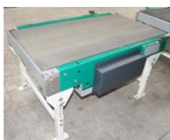
Reference: TCZ-043 PLASTIC BELT CONVEYOR Year: . Brand: VAN DAR LANDEN