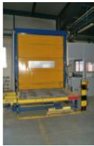
Reference: STI-067 TRANSPORT LINE FOR PALLETS Year: . Brand: ESPAÑOL