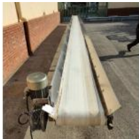
Reference: PNS-022 PLASTIC BAND CONVEYOR BELT Year: 2003 Brand: MARTIN MAQ