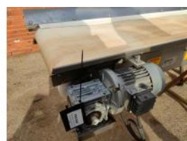
Reference: PNS-039 PLASTIC BAND CONVEYOR BELT Year: 2003 Brand: MARTIN MAQ