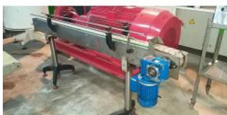
Reference: NCC-206 CONVEYOR BELT Year: . Brand: .