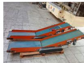
Reference: PNS-052 CONVEYOR BELT Year: . Brand: EMPAC S.A