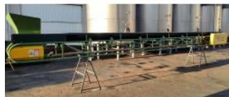
Reference: BCH-141 PLASTIC BELT CONVEYOR Year: . Brand: TREICO