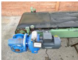
Reference: PNS-035 PLASTIC BAND CONVEYOR BELT Year: . Brand: .