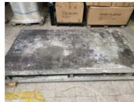
Reference: AZC-048 PANTOGRAPH ELEVATOR Year: . Brand: COMBURSA