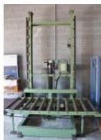
Reference: ALS-018 MOTORIZED ROLLER BELT Year: . Brand: .