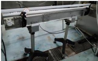
Reference: NTM-050 CONVEYOR BELT Year: 2015 Brand: INOX-FERRO SANCHEZ S.L