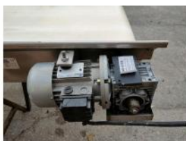
Reference: PNS-033 PLASTIC BAND CONVEYOR BELT Year: 2003 Brand: MARTIN MAQ