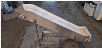
Reference: EBV-004 PRODUCT ELEVATOR Year: . Brand: .