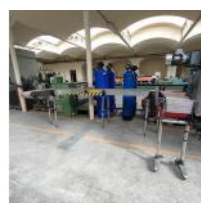
Reference: FTR-037 CONVEYOR BELT Year: . Brand: .