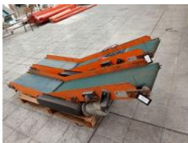
Reference: PNS-051 CONVEYOR BELT Year: . Brand: EMPAC S.A