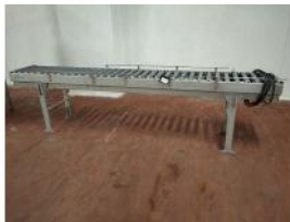
Reference: MOR-032 MOTORIZED ROLLER CONVEYOR Year: . Brand: SOCO SYSTEM