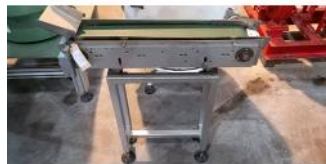
Reference: NCC-205 CONVEYOR BELT Year: . Brand: .