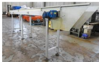
Reference: ALS-009 PLASTIC BAND CONVEYOR Year: . Brand: .