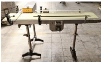
Reference: GBF-031 CONVEYOR BELT Year: . Brand: .