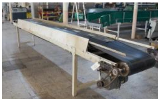
Reference: ALS-010 PLASTIC BAND CONVEYOR Year: . Brand: .