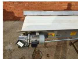
Reference: PNS-037 PLASTIC BAND CONVEYOR BELT Year: 2003 Brand: MARTIN MAQ