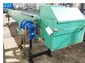
Reference: CAO-043 RUBBER BAND CONVEYOR Year: . Brand: TEZASA