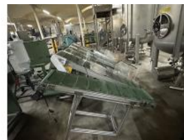
Reference: ZIP-011 CONVEYOR BELT Year: . Brand: .