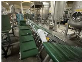
Reference: ZIP-014 CONVEYOR BELT Year: . Brand: .