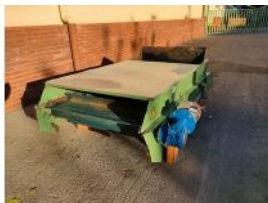
Reference: PNS-043 ELEVATING CONVEYOR BELT Year: . Brand: IMAÑA