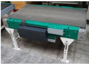
Reference: TCZ-038 PLASTIC BELT CONVEYOR Year: . Brand: VAN DAR LANDEN