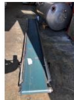
Reference: ICS-015 CONVEYOR BELT Year: . Brand: .