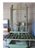
Reference: ALS-018 MOTORIZED ROLLER BELT Year: . Brand: .