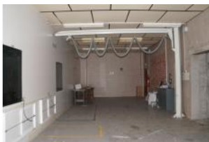
Reference: TOR-006 HOIST FLAG Year: . Brand: .