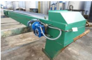
Reference: CAO-037 RUBBER BAND CONVEYOR Year: . Brand: TEZASA