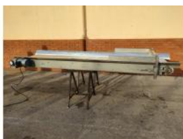
Reference: PNS-038 PLASTIC BAND CONVEYOR BELT Year: 2003 Brand: MARTIN MAQ