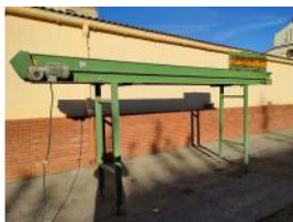
Reference: PNS-044 PLASTIC BAND CONVEYOR BELT Year: . Brand: .