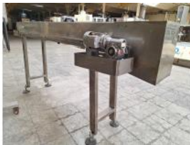
Reference: FTR-029 CONVEYOR BELT Year: 2003 Brand: RODANT