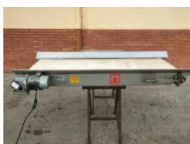
Reference: PNS-042 PLASTIC BAND CONVEYOR BELT Year: 2003 Brand: MARTIN MAQ