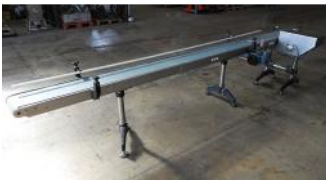
Reference: GBF-005 PLASTIC CONVEYOR BELT Year: . Brand: .