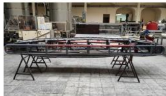
Reference: DYN-004 BAND OF RUBBER BANDS Year: . Brand: .