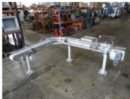
Reference: GBF-001 "L" NYLON FLAT CONVEYOR BELT Year: . Brand: FLEX-LINK