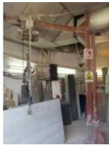
Reference: MAR-002 CRAIN ARM Year: . Brand: .