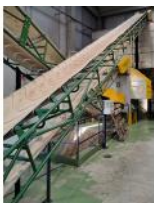
Reference: MZA-039 CONVEYOR BELT Year: . Brand: TREICO