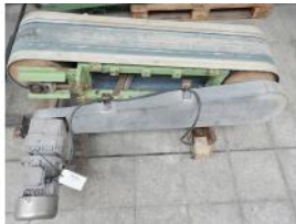
Reference: CAO-019 CONVEYOR BAND Year: . Brand: .