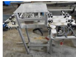
Reference: ADT-001 CONVEYOR BELT Year: . Brand: SINERGES