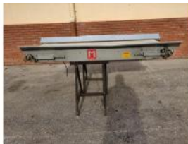
Reference: PNS-034 PLASTIC BAND CONVEYOR BELT Year: 2003 Brand: MARTIN MAQ