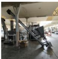
Reference: FTR-038 PRODUCT ELEVATOR Year: . Brand: .