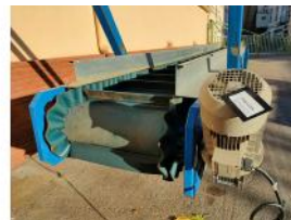
Reference: PNS-025 PLASTIC BAND CONVEYOR BELT Year: . Brand: .