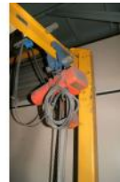
Reference: JHA-025 HOIST FLAG Year: 2003 Brand: KOLI