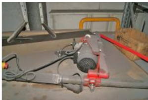
Reference: JHA-029 HOIST FLAG Year: . Brand: BELFLEX