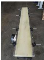
Reference: GBF-008 PLASTIC CONVEYOR BELT Year: . Brand: .