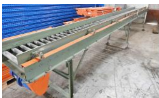
Reference: NCC-186 MOTORIZED ROLLER CONVEYOR Year: . Brand: .