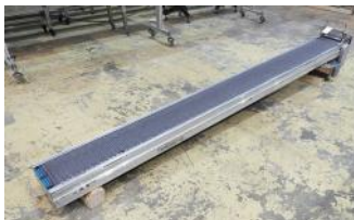
Reference: NCC-120 CONVEYOR BELT Year: . Brand: .