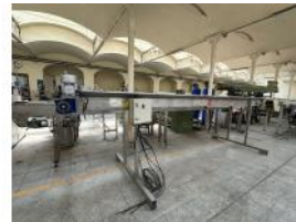
Reference: PNS-056 CONVEYOR BELT Year: 2005 Brand: MARTIN MAQ