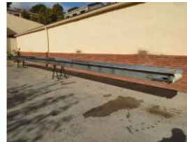
Reference: PNS-021 PLASTIC BAND CONVEYOR BELT Year: 2003 Brand: MARTIN MAQ