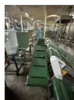
Reference: ZIP-013 CONVEYOR BELT Year: . Brand: .