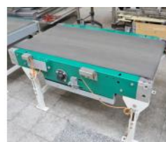
Reference: TCZ-040 PLASTIC BELT CONVEYOR Year: . Brand: VAN DAR LANDEN