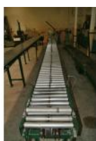
Reference: CIR-015 ROAD MOTORIZED ROLLER Year: . Brand: .