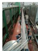
Reference: TVE-031 PLASTIC BAND CONVEYOR BELT Year: . Brand: .