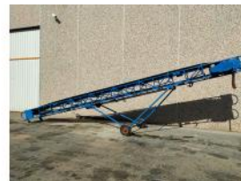
Reference: DHC-205 MOBILE CONVEYOR BELT Year: . Brand: .