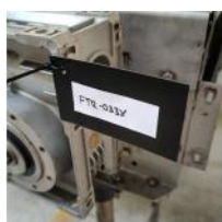
Reference: FTR-033 CONVEYOR BELT Year: . Brand: .