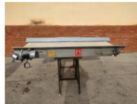
Reference: PNS-032 PLASTIC BAND CONVEYOR BELT Year: 2003 Brand: MARTIN MAQ