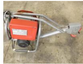
Reference: STO-003 CRAIN ARM Year: . Brand: MOM