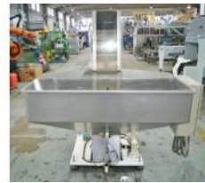
Reference: CYP-010 PRODUCT ELEVATOR Year: . Brand: .