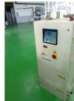
Reference: PFP-007 DEHUMIDIFYING DRYER Year: 1997 Brand: MORETTO