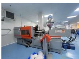
Reference: PFP-005 INJECTION MOULDING MACHINE Year: 1986 Brand: SANDRETTO