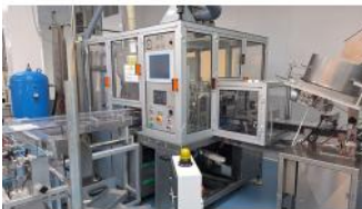
Reference: PFP-012 AUTOMATIC CAP DOSING AND ASSEM... Year: 2012 Brand: REBEL, S.A.