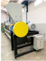
Reference: ALS-004 RIPPING MILL FOR PLASTIC AND O... Year: . Brand: .