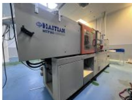
Reference: PFP-003 INJECTION MOULDING MACHINE Year: 2000 Brand: NINGBO HAITIAN