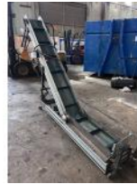
Reference: ICS-014 PRODUCT ELEVATOR CONVEYOR Year: 1998 Brand: CRIZAF