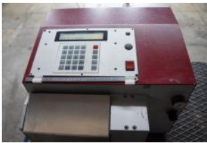
Reference: SDC-009 ELECTROPNEUMATIC CUTTING AND S... Year: . Brand: TEKUWA