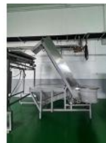
Reference: PFP-009 FEEDER CONVEYOR Year: . Brand: .