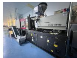
Reference: PFP-004 INJECTION MOULDING MACHINE Year: 2003 Brand: NINGBO HAITIAN