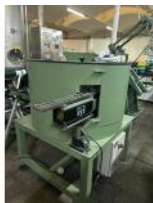
Reference: ZIP-022 DYNAMIC FEEDER Year: . Brand: TAD