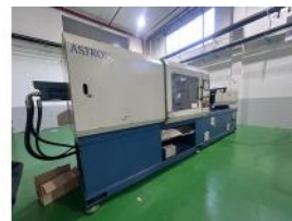
Reference: PFP-002 INJECTION MOULDING MACHINE Year: 2003 Brand: JONWAI