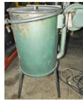
Reference: GRB-011 PELLET DRYER Year: . Brand: .