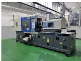
Reference: PFP-001 INJECTION MOULDING MACHINE Year: 2013 Brand: KAI MING