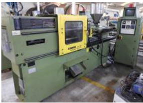
Reference: GRB-002 PLASTIC INJECTOR Year: 1989 Brand: ARBURG ALLROUNDER