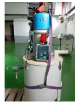
Reference: PFP-011 VACUUM LOADER WITH STORAGE HOPPER Year: 2011 Brand: SHINI