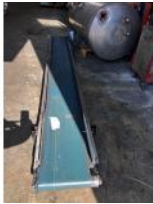
Reference: ICS-015 CONVEYOR BELT Year: . Brand: .