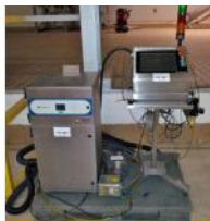
Reference: NUT-012 LASER MARKER Year: 2005 Brand: DOMINO