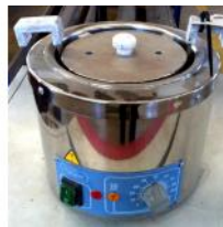
Reference: BPS-045 THERMOSTATIC BATH Year: . Brand: RAYPA