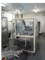
Reference: PGM-013 TRAY FORMER Year: 1997 Brand: TECMA PACK