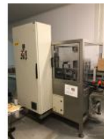
Reference: PGM-011 LINE SPLITTER Year: 1997 Brand: TECMA PACK