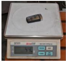
Reference: PUI-021 SCALES LABORATORY Year: . Brand: GRAM