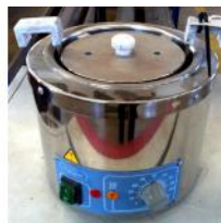
Reference: BPS-048 THERMOSTATIC BATH Year: . Brand: RAYPA