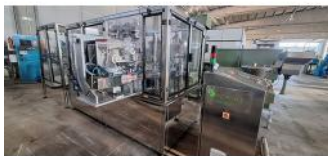
Reference: EBV-001 AUTOMATIC FILLER/DOSING MACHINE Year: 2016 Brand: ANCIMO