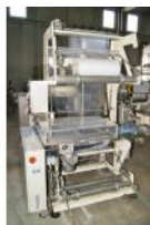
Reference: NUT-015 PLASTIC FEEDER Year: 1992 Brand: LSP MAEM