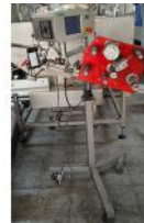
Reference: FTR-016 LABELING HEAD Year: 2012 Brand: RUSÁN