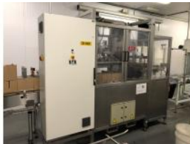
Reference: PGM-012 CASE PACKER TECMA PACK Year: 1997 Brand: TECMA PACK