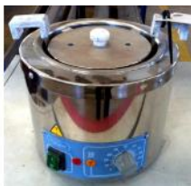
Reference: BPS-046 THERMOSTATIC BATH Year: . Brand: RAYPA