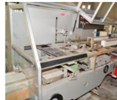
Reference: PUI-002 CARTONING Year: 1999 Brand: CAM 7 SRL