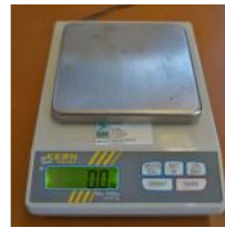
Reference: NUT-024 LABORATORY BALANCE Year: . Brand: KERN