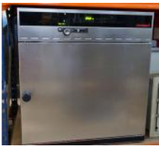
Reference: NUT-004 BACTERIOLOGICAL CULTURE OVEN Year: . Brand: MEMMERT