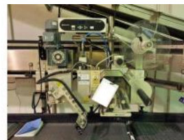
Reference: NUT-010 PRINTER/DISPENSING LABELS Year: 2009 Brand: DOMINO