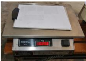
Reference: PUI-029 SCALES LABORATORY Year: . Brand: MOBBA