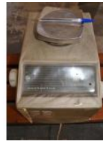
Reference: PUI-028 SCALES LABORATORY Year: . Brand: SARTORIUS