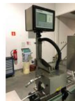
Reference: PGM-008 REVISION AND CHECKMAT CONTROL ... Year: 2002 Brand: KRONES